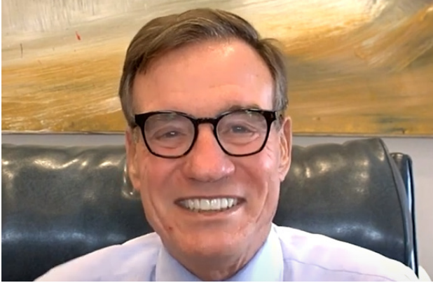
Sen. Mark Warner (D-VA), member of the Senate Finance; Banking, Housing and Urban Affairs; Budget Committees discussed bipartisan efforts to invest in the nation's infrastructure, affordable housing investment, and address deficit reductions.

recommendations, the Treasury's regulations give borrowers and lenders the flexibility they need to replace LIBOR with virtually any other index that reflects objective changes in the cost of borrowing money without tax consequences.