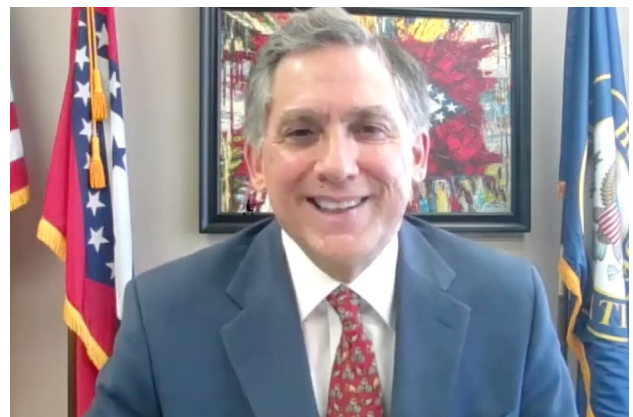
Rep. French Hill (R-AR) serves on the influential House Financial Services Committee, and is the Ranking Member of the Housing, Community Development and Insurance Subcommittee.

The Roundtable and its partner associations support a long-term reauthorization and reform of the NFIP that will help property owners and renters prepare for and recover