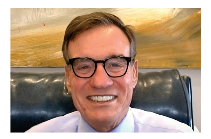
Sen. Mark Warner (D-VA), member of the Senate Finance; Banking, Housing and Urban Affairs; Budget Committees discussed bipartisan efforts to invest in the nation's infrastructure, affordable housing investment, and address deficit reductions.

recommendations, the Treasury's regulations give borrowers and lenders the flexibility they need to replace LIBOR with virtually any other index that reflects objective changes in the cost of borrowing money without tax consequences.