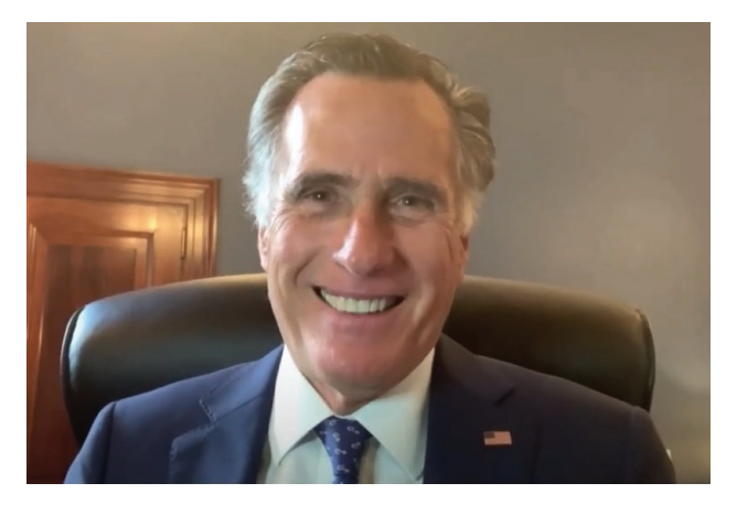
As a member of the Senate Foreign Relations, Homeland Security & Government Affairs Committees Sen. Mitt Romney (R-UT) discussed the committees' work on addressing ransomware attacks, cyber security, and international and domestic terrorism.

The Roundtable works with various federal, state, and local law enforcement agencies through its HSTF. The HSTF identifies, analyzes, and advocates for positions on physical and cyber security policy affecting the real estate community and commercial facilities sector in relevant homeland security and intelligence issue areas. In addition to working with relevant law enforcement and intelligence agencies, the HSTF is working to find new sources and methods to secure high-profile commercial-facility-sector assets and improve their emergency preparedness. Through the work of the HSTF and RE-ISAC, real estate firms are regularly updated on cyber, criminal, and physical threats and how to appropriately implement security measures to help mitigate risks.